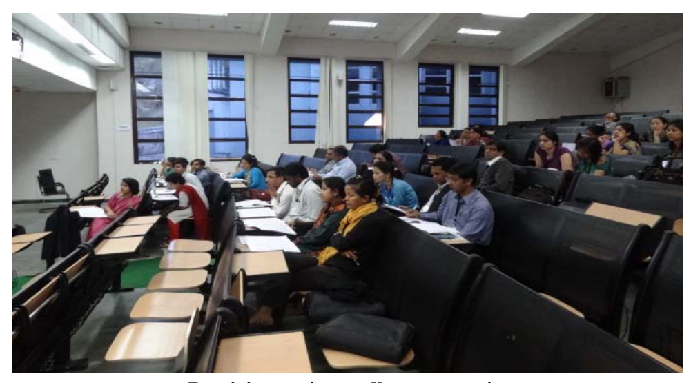
Participants in small group session